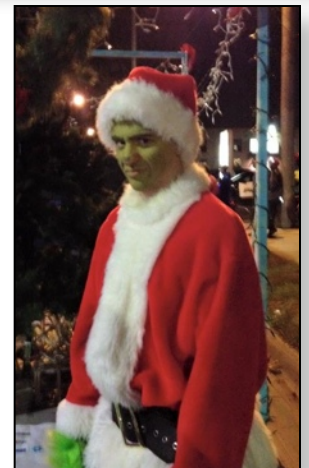
More photos from Fire & Ice parade and the The Grinch who Stole Christmas .

Peoples Church is a vibrant, welcoming spiritual community that empowers and encourages its members to develop and explore more sacred, positive and healthy lives through reflection, education and community outreach.