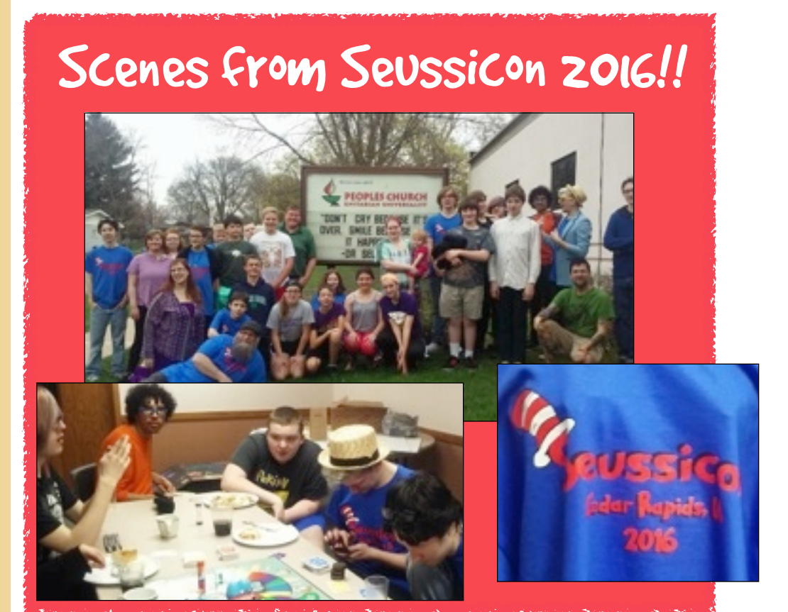
More Seussicon on p.6

Coffee Hour in the Ely Room follows worship.